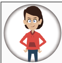
Penny the Accountant