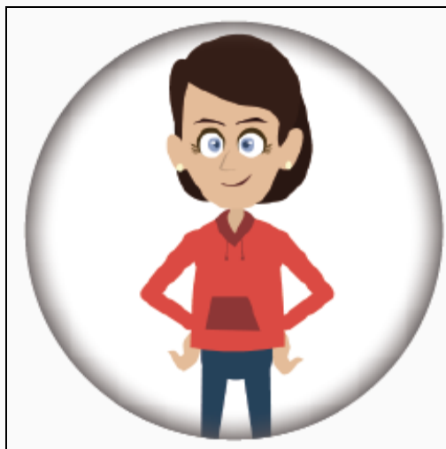
Penny the Accountant

http://support.orchestrated.com/hc/en-us/articles/207138037